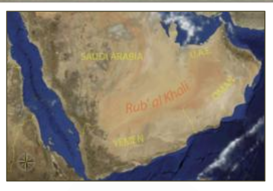
The Arabian Peninsula with countries and Rub' al Khali