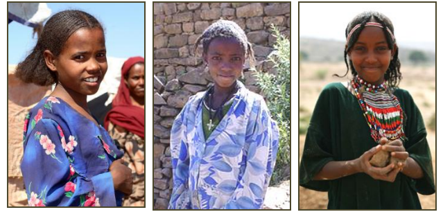
Children of the Amhara, Tigray and Afar regions.