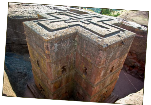
Rock-hewn church in Lalibela