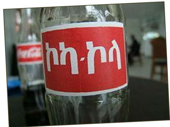
A modern usage of Amharic: the label of a Coca-Cola bottle.