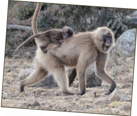
Gelada baboon mother and baby seen in Semien Mountains National Park