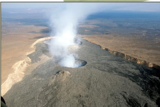
Erta Ale volcano