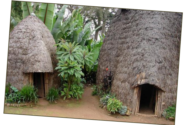
Traditional Dorze hut looks like a giant beehive