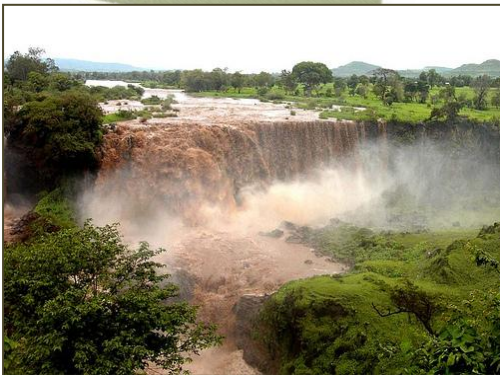
Blue Nile