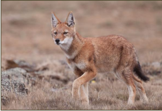
Ethiopia Wolf seen near the Bale Mountains