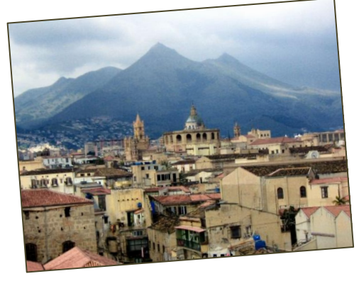
Palermo, Sicily