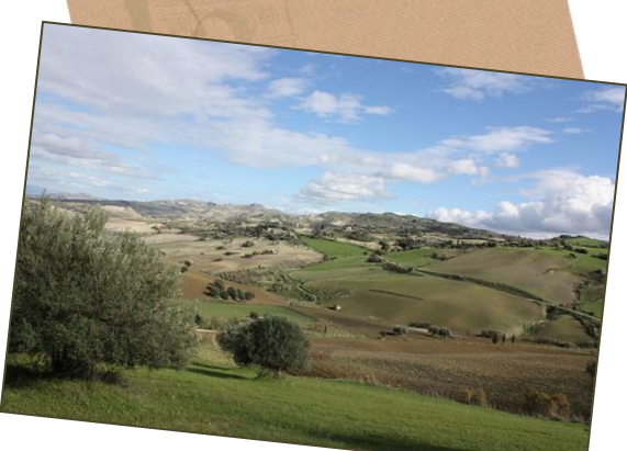
Olive trees on Sicily