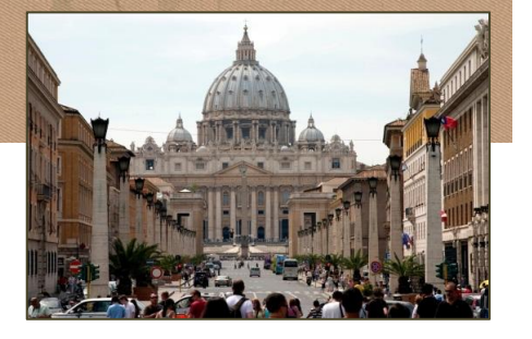
St. Peter's Basilica

Vatican City State was created in 1929. It is a walled area within Rome and its area (about 110 acres (44 hectares) and population (approximately 800) makes it the smallest independent state in the world in both categories. St. Peter's Basilica is the largest Christian church in the world and took 120 years to build (1506 to 1626).