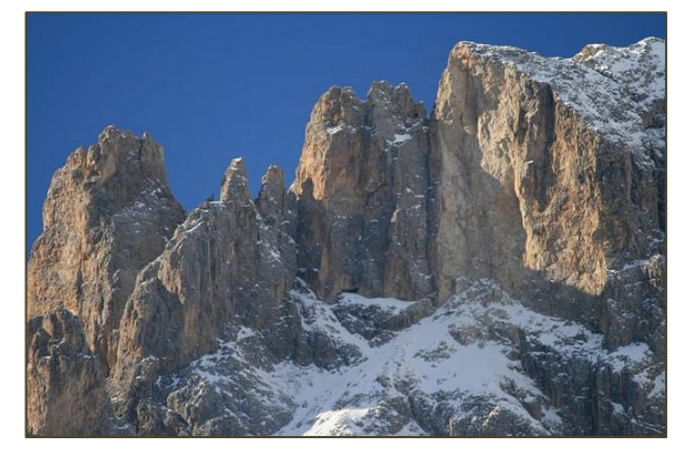
The Dolomite Mountains