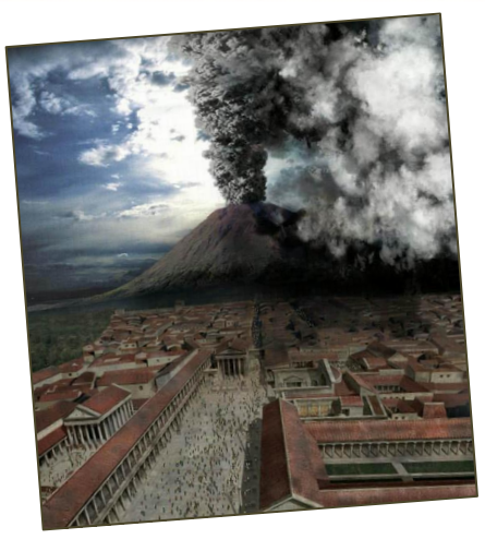
Painting of Mount Vesuvius erupting in 79 AD