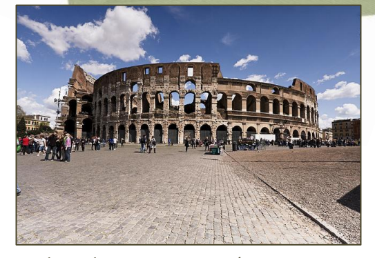
The Colosseum in Rome