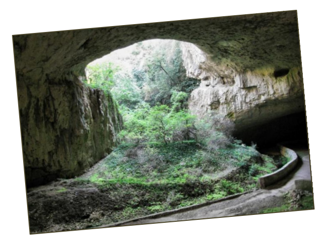
Entrance to Devetashka Cave