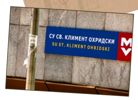
Subway sign in Sofia

The Cyrillic alphabet is the main written script used in Russia, Mongolia, Kazakhstan, Kyrgyzstan, Tajikistan, Ukraine, Belarus, Serbia, Montenegro and Bulgaria. It was developed during the First Bulgarian Empire in the 10<sup>th</sup> century. The script was based on ancient Greek script and modified to include sounds not supported by that language. There are 33 letters. For example, "Bulgaria" is represented by България in Cyrillic.