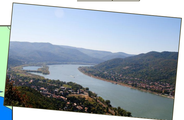
Danube River map and the river flowing through Hungary