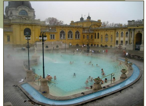
Széchenyi Medicinal Bath in Budapest

There are an estimated 1,300 natural underground thermal springs in Hungary. One-third of these are used as spas. People visit there for relaxation and relief of aches and pains. Budapest itself has 118 springs, with mineral water gushing at temperatures from 70°F (21°C) to (169°F) 76°C.