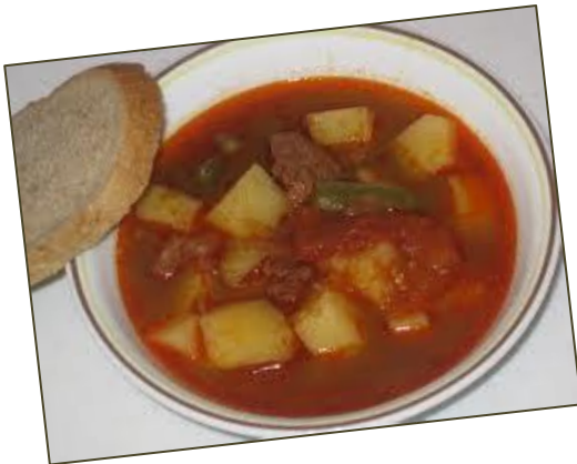
Hungarian goulash