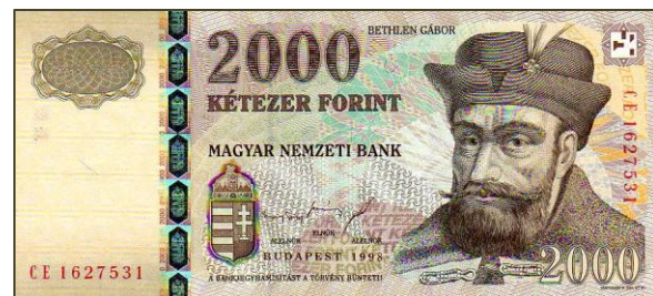
The Forint is the currency of Hungary. As of December 2011, 2,000 Forint equals about $8.55 USD (source: Wikipedia.org )