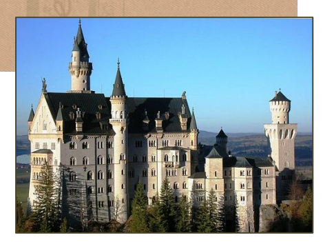
Neuschwanstein Castle

Germany has one of the largest numbers of castles in the world, with over 150 castles in the country. Some are now hotels and others are museums. One of the most famous castles is Neuschwanstein, in southern Germany. It was built by Ludwig II, the king of Bavaria. It was inspiration for Walt Disney's Sleeping Beauty Castle.