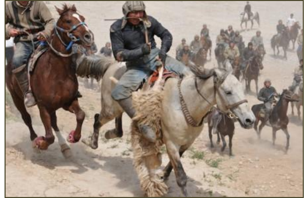
Buzkashi is a popular game played in Central Asia that's similar to polo except that it uses a goat carcass instead of a ball.