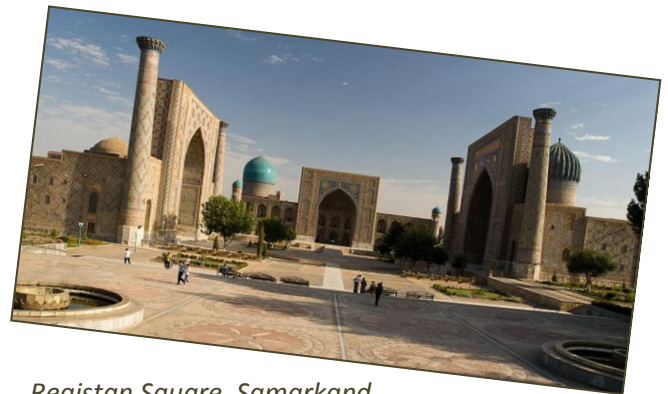
Registan Square, Samarkand