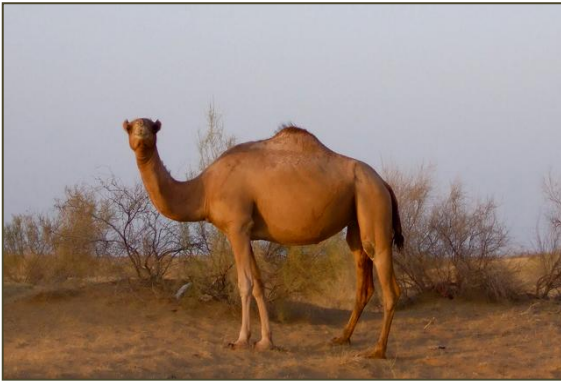
Camel in the Qizilqum desert