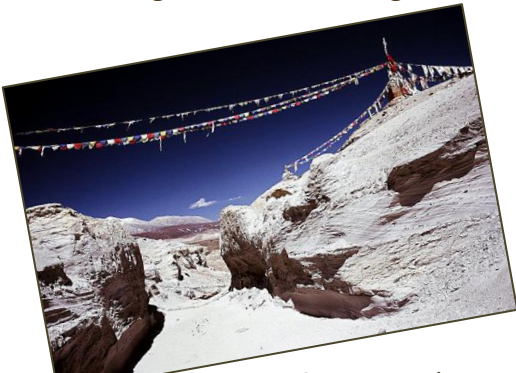
Prayer flags at Lo / Mustang mountain pass