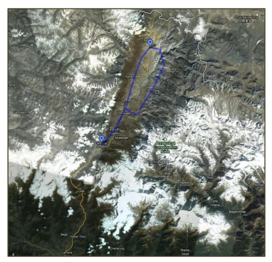
Approximate route of our trek. Click the map to view in Google Maps