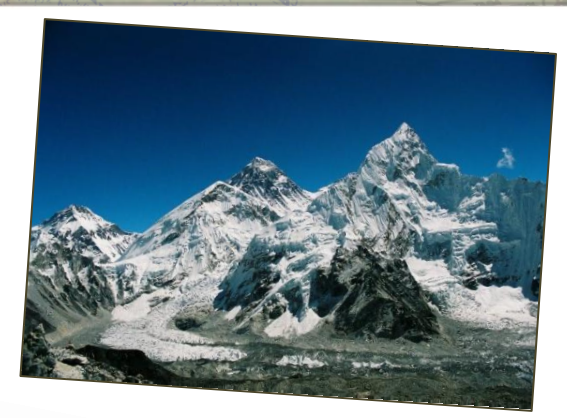
Mount Everest, located on the Nepal / China border