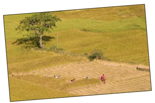
Harvesting rice in the Terai region