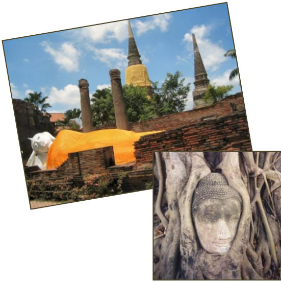
Ayutthaya