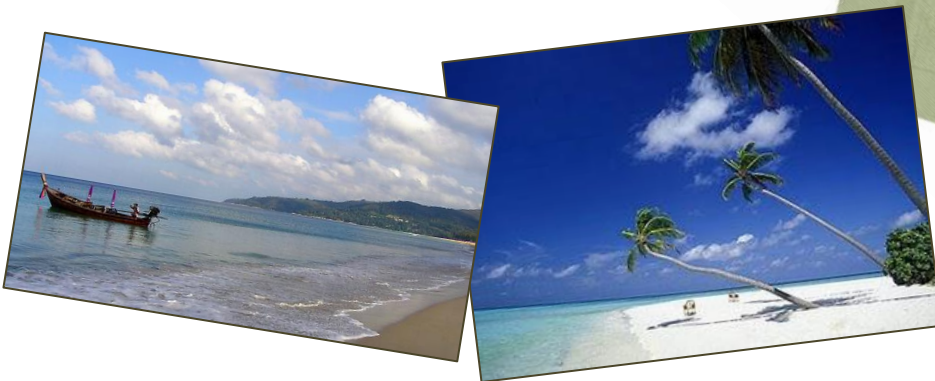
Left: Phuket, Right: Ko Samui

Thailand is famous for its beaches and islands, which are a major tourist attraction. Found in the southern portion of the country, these include Phuket, Koh Samui, Krabi and Koh Phi Phi. In 2004 the Indian Ocean tsunami damaged many of the tourist areas on the Andaman Sea side of the country, which have since recovered.