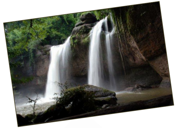
Haeo Suawt Waterfall in Khao Yai National Park