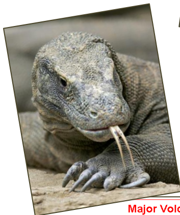
Komodo dragon