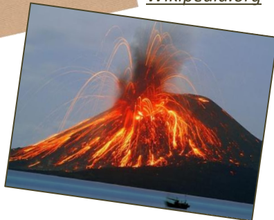
Mount Merapi erupting in 2011 on the island of Java