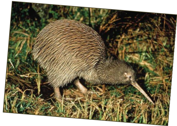
The kiwi