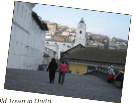
Old Town in Quito