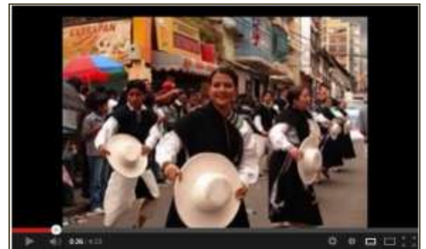
Listen to sanjuanito music and view pictures (4:23)