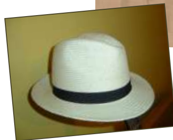
Panama hat