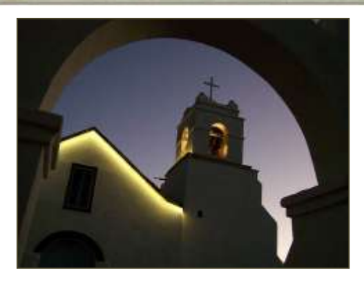
Iglesia San Pedro de Atacama