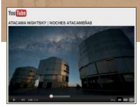
sources: <u>Flickr.com/ESO</u> (Text), <u>YouTube/NikoBustos</u> (6:24)

The ESO Very Large Telescope (VLT) is located in the Atacama Desert of Chile. The four telescopes work together (using a technique called interferometry), allowing the astronomers there to see details up to 25 times finer than any of the individual telescopes.