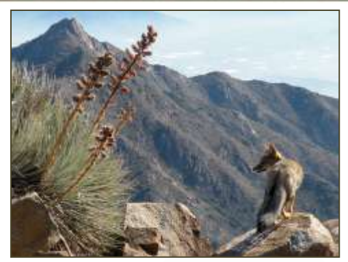
South American Gray Fox (Zorro)