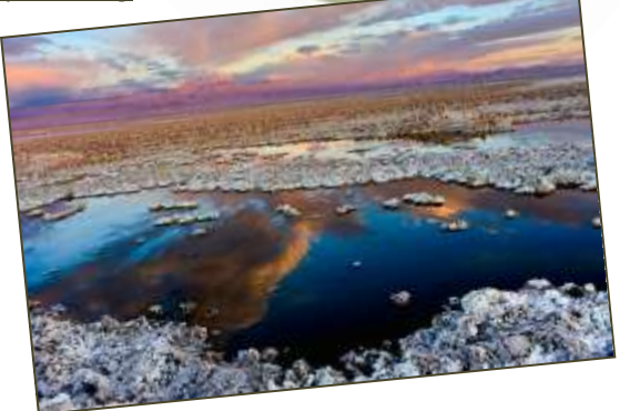
Dry lake in Salar de Atacama region with the Licancabur volcano in the background.