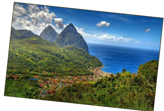
St. Lucia