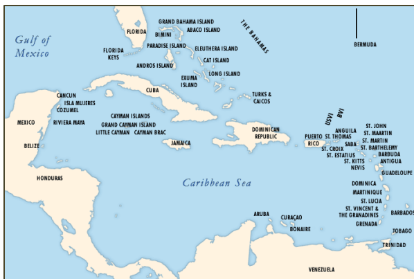
Caribbean map