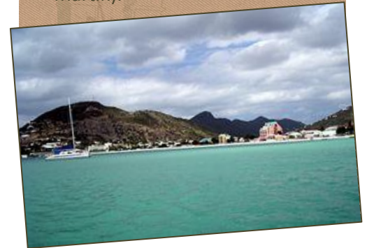
Dutch Sint Maarten

The island of Saint Martin is the smallest inhabited territory in the world divided by two nations. It was discovered by Columbus during his second voyage. In 1648 a treaty divided the island between France and the Netherlands. Half the island (population 41,000) is a Dutch territory (Sint Maarten) and the other half (population 36,000) is a French possession (Saint-Martin).