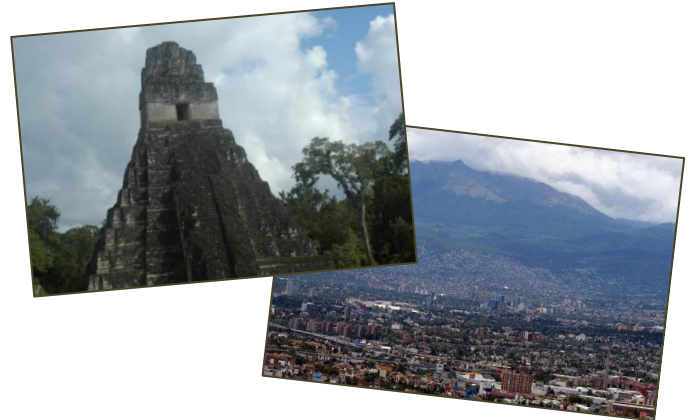
Mayan ruins in Tikal, Guatemala and modern Mexico City