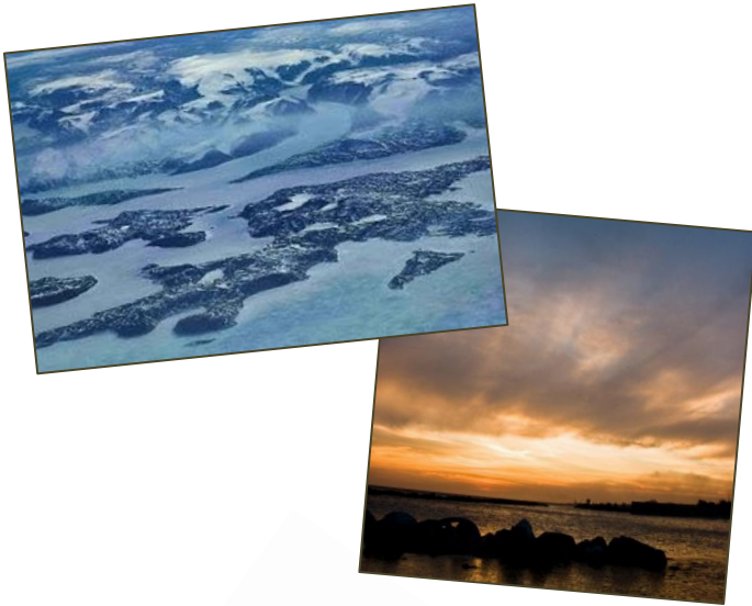
Baffin Island in the Canadian Arctic and sunset on the Caribbean island of Curacao