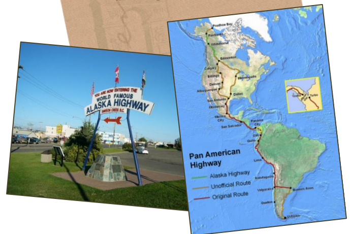
Southern start to the Alaskan Highway and highway routes

It is possible to travel by road from Alaska in the north to Panama in the south, via several highway systems. After a break in the Darien Gap between North America and South America, the Pan American Highway continues all the way to Argentina and Chile.