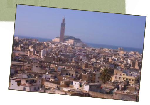
Casablanca with the Hassan II Mosque in the background

Casablanca's Hassan II Mosque is the second largest mosque and third largest religious structure in the world. The mosque building can accommodate up to 25,000 people and the courtyard can hold another 80,000 individuals. Two hundred people are needed to clean the mosque daily. It was completed in 1993 after taking seven years to build.