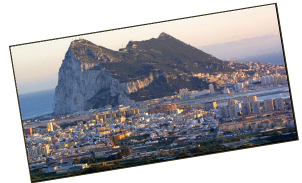
The Gibraltar rock overlooking the city