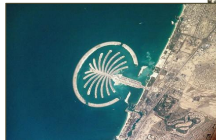
One of the Palm Islands