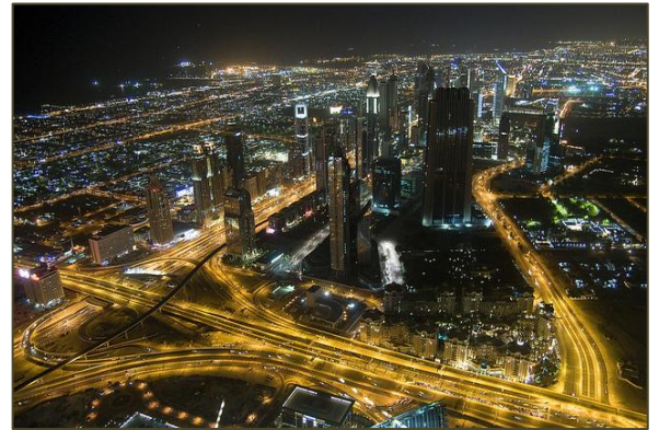
Dubai at night