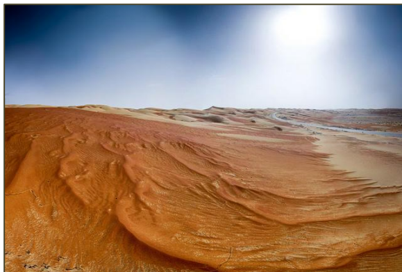
Rub' al Khali sand