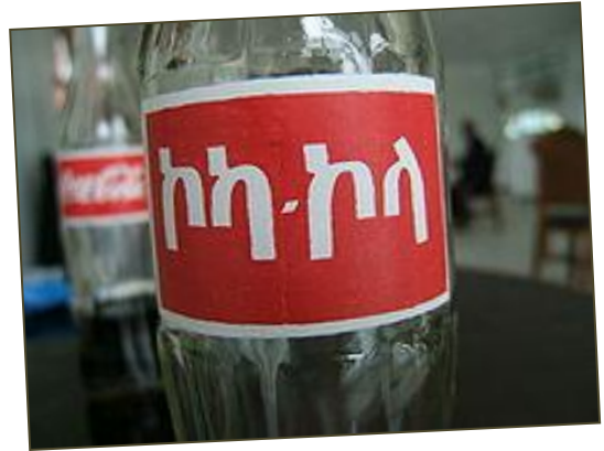
A modern usage of Amharic: the label of a Coca-Cola bottle.