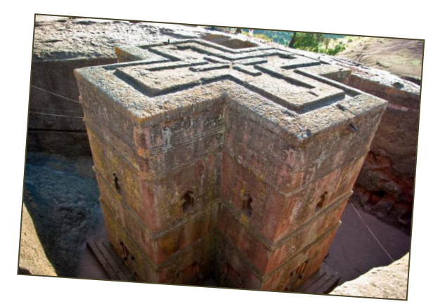
Rock-hewn church in Lalibela