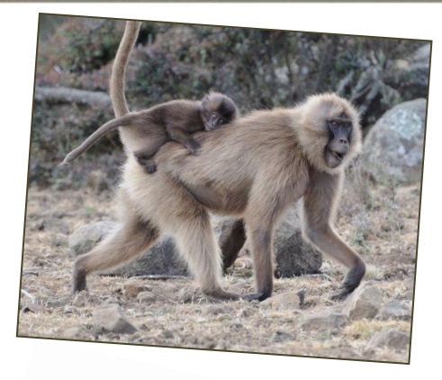
Gelada baboon mother and baby seen in Semien Mountains National Park