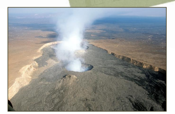
Erta Ale volcano