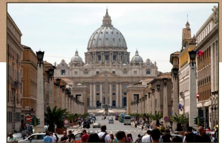
St. Peter's Basilica

Vatican City State was created in 1929. It is a walled area within Rome and its area (about 110 acres (44 hectares) and population (approximately 800) makes it the smallest independent state in the world in both categories. St. Peter's Basilica is the largest Christian church in the world and took 120 years to build (1506 to 1626).