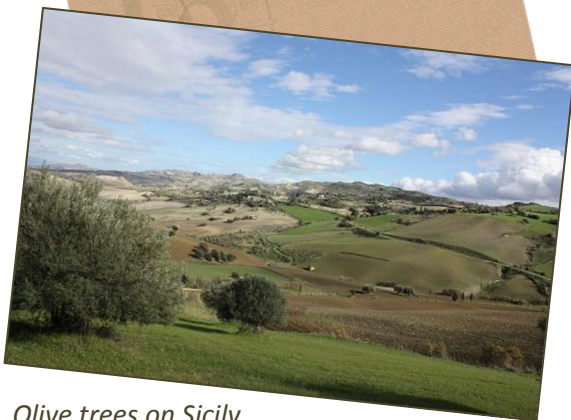
Olive trees on Sicily

Olive trees were imported by the Greeks to Sicily in the 5 th century BC. Olives has been grown for hundreds of years, with Sicily producing about 10% of Italy's olive oil. Harvest season takes place between September and November and most olives are harvested by hand.