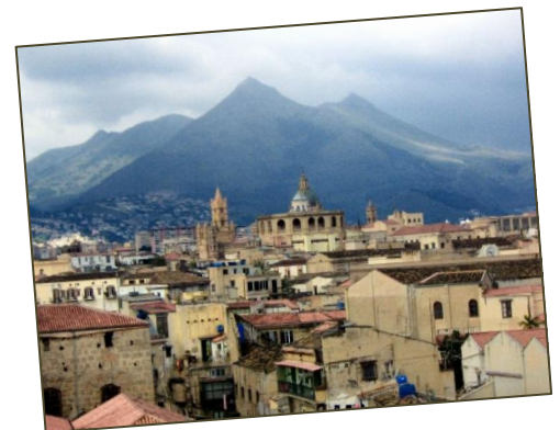
Palermo, Sicily