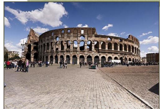
The Colosseum in Rome