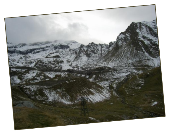
The Transylvanian Alps in the Carpathian Mountains