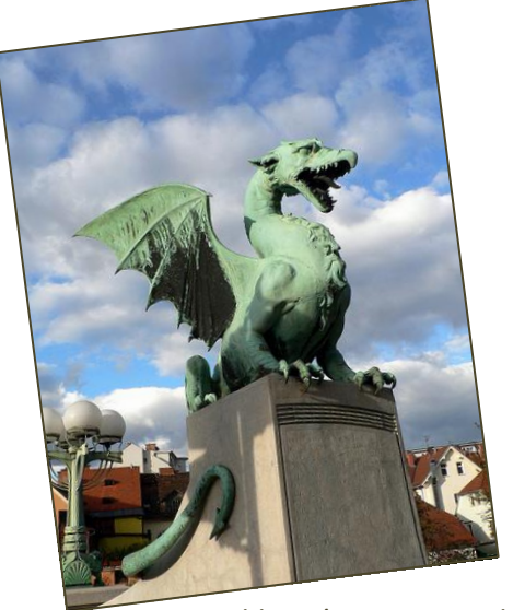
Lujubljana's Dragon Bridge