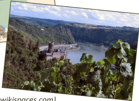
Map and view of the Rhine River