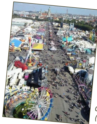
Oktoberfest view

Click the picture above to watch an excerpt from Beethoven's 9th Symphony (15:46)