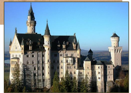
Neuschwanstein Castle

Germany has one of the largest numbers of castles in the world, with over 150 castles in the country. Some are now hotels and others are museums. One of the most famous castles is Neuschwanstein, in southern Germany. It was built by Ludwig II, the king of Bavaria. It was inspiration for Walt Disney's Sleeping Beauty Castle.