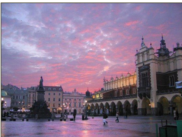
The main square of Kraków. This area was declared a UNESCO World Heritage Site in 1978. (source: UNESCOworldheritagesites.com )