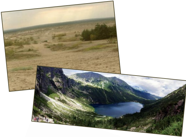
Błędów Desert and Tatra Mountains