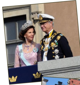
The King and Queen of Sweden