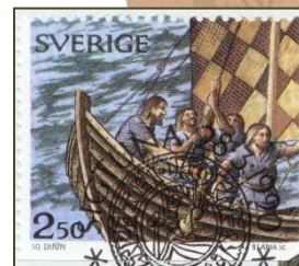
Swedish Viking stamp

The Viking period took place from about 750 to 1060 AD. Swedish Vikings, unlike their Norwegian and Danish counterparts, moved eastward, rather than westward. In the 9th and 10th centuries, Swedish Vikings controlled areas as far away as present-day Istanbul and the Caspian Sea. The first kingdom of Russia was founded by Vikings and many Russian Tsars were of Swedish Viking descent.