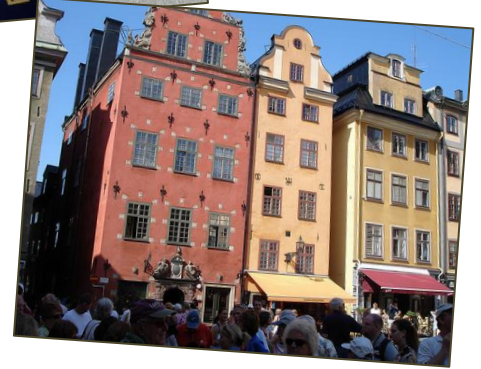
Old town Stockholm