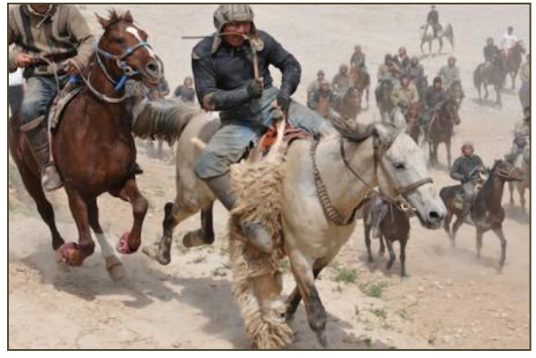
Buzkashi is a popular game played in Central Asia that's similar to polo except that it uses a goat carcass instead of a ball.