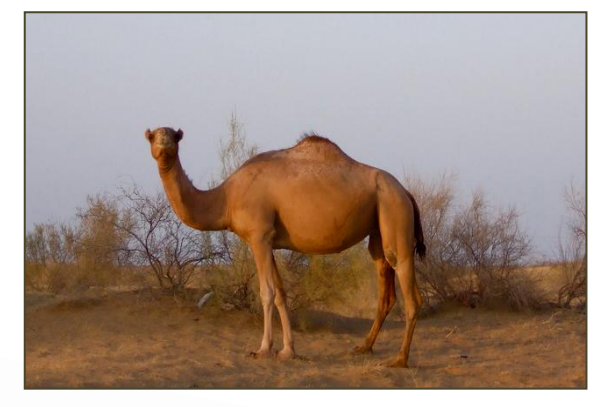
Camel in the Qizilqum desert