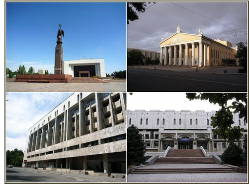
Relics of the Soviet-era