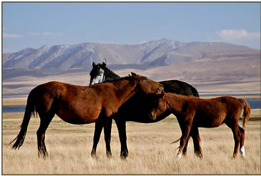
Horses play in the steppe of Kyrgyzstan