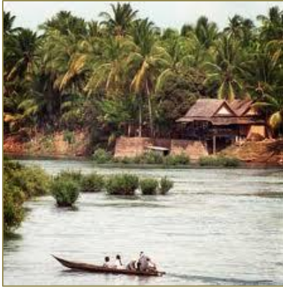
Village along the Mekong River