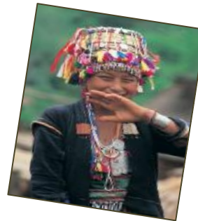
Lao girl