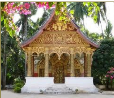
Luang Prabang temple