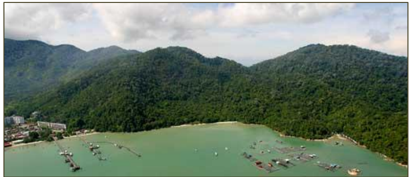
View of Penang National Park from the coast