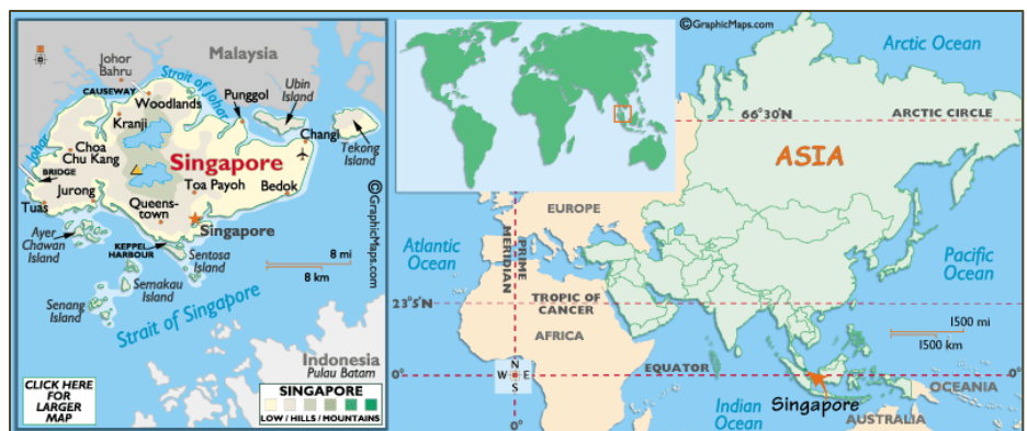
Map of Singapore and equator