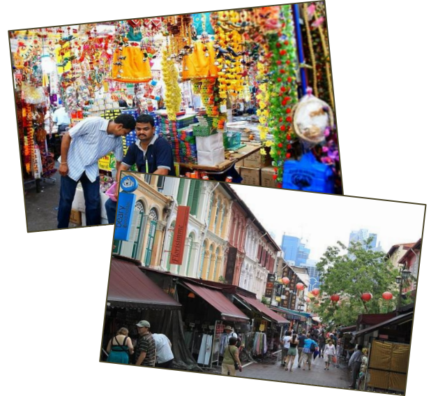
Little India and Chinatown