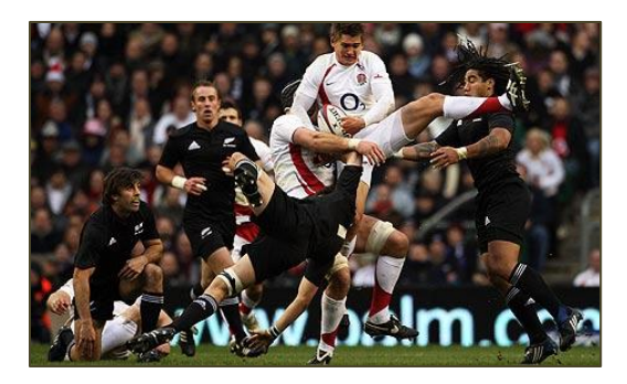
Rugby is one the most popular sports in New Zealand. It was invented about 70 years before American football and has some similarities