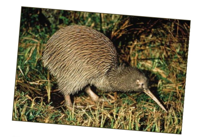
The kiwi