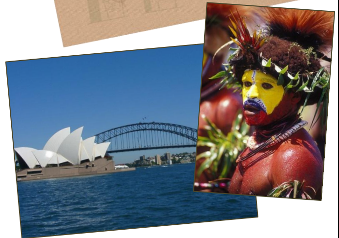
Sydney Opera House and Huli man from Papua New Guinea