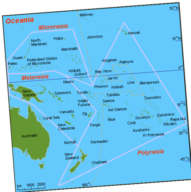
Oceania map