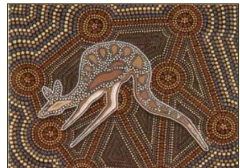
One of the world's oldest cultures, Aborigines created art, using symbols, to tell stories